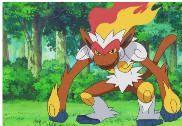
Fig. 13. Gōkazaru from the anime Pokemon .

In episode no. 631 of the media franchise Pokemon ( Pokémon ) there is a ‘pocket monster’ which appears to be based on a monkey with gold elements in its design, Gōkazaru (aka Infernape, figure 13).