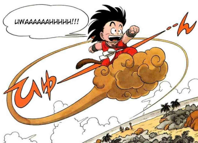
Fig. 14. Gokū on his nimbus for the first time, from the manga Dragon Ball chapter 4. Source: https://dragonballread.com/manga/dragon-ball-chapter-4-online-read .

hero and the audience learned that he was a Saiyan from planet Vegeta sent to the Earth with a plan to conquer. In the first episode, we read about the encounter of Son Gokū and Bulma, a brilliant girl who invented a dragon radar; this encounter sets in motion the theme of the quest for the seven ‘dragon balls’, spheres scattered throughout the planet Earth 17 capable of making a dragon 18 appear and grant a wish when they are gathered. The search for the spheres will involve encounters and clashes with other characters and demons; some of them will join the pursuit. In addition to the tail that comes out of a hole in his suit, the young Saiyan’s distinctive feature is his innate strength. He handles a length-changing staff skilfully, and after the meeting with Master Roshi, he moves by air through his flying nimbus (fig. 14).