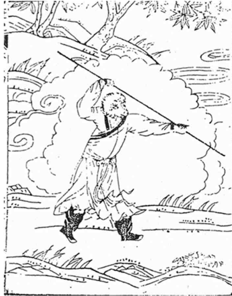
Fig. 3. Sun Wukong while attacking with his staff in JtW -‘Shidetang’ edition.

Tripitaka in order to serve his sentence only by accompanying him in his search for sutras. He wears an ochre dress, at the waist a tiger skin loincloth, on his feet cloud-walking boots, and on his head a magical circlet. He holds a golden-banded staff that can change size, fly, and attack opponents according to its master's will (figure 3).