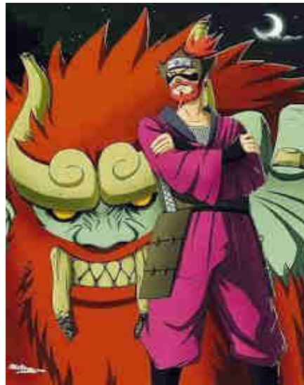
Fig. 12. Son Gokū and Rōshi in Naruto: Shippūden .

elongated fangs, and two long horns curving upwards on its forehead like a crown. This creature was sealed within a person, Rōshi.