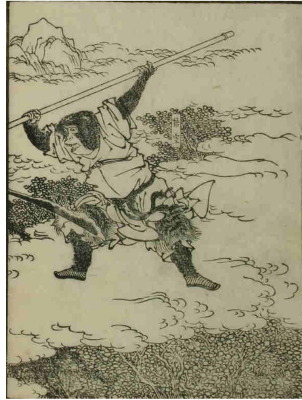
Fig. 4. Son Gokū while fighting in the first edition of Ehon Saiyū zenden .

After having provided this historical background, from the following section on the article mainly focusses on the transcultural ties between China and Japan and on the concept of media pilgrimage; previous and future references to India are intended to point out the historical pilgrimage route thoroughly.