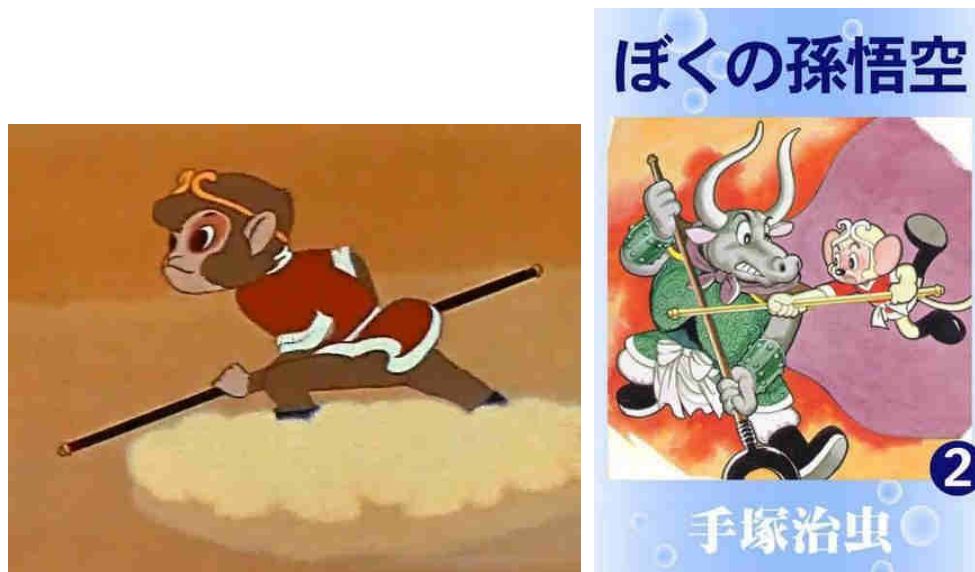
Fig. 7 & 8. (Left) Son Gokū on his cloud from Saiyūki . (Right) Son Gokū fights Bull Demon King, cover of Boku Son Gokū vol. 2.

Another of Sun Wukong's earliest Japanese representations is the anime series Gokū no daibōken ('The great adventure of Gokū', 1967, figure 9).