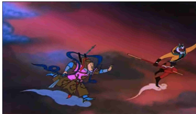
Fig. 6. The Monkey King engages Erlang Shen in a duel. Screenshots from 'Havoc in Heaven' (MonkeyKing FansFactory, 2015: timecode 1:34:04).

'Havoc in Heaven' ( Danao tiangong or 大闹天宫, figure 6), also translated as 'Uproar in Heaven', is a Chinese animated film directed by Wan Laiming and produced by Wan Guchan, Wan Chaochen (1906-1992), and Wan Dihuan (1907-?). The film was released in the early 1960s. The story is an adaptation of the earlier chapters of JtW , in which the Monkey King rebels against the Jade Emperor of heaven.