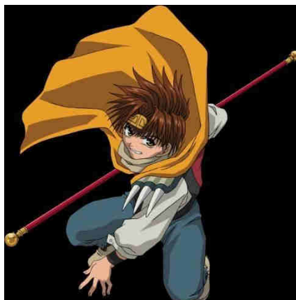
Fig. 11. Cover of the first manga volume of Saiyūki.

Saiyūki (figure 11) is a manga series by Minekura Kazuya (1975-) distributed from 1997 to 2002. It is more like a remake of JtW . The protagonist Son Gokū is a cheerful and lively boy, always hungry, naive, and has great confidence in people despite his troubled history. He was locked up in Japan's Gogyō Mountain ('Mountain of the five elements') for a sin he had committed five hundred years before in the Tenkai and remained there until the priest/monk Genjō Sanzō freed him. As for Sun Wukong, he can turn to the Great Saint Equal to Heaven, his appearance becomes slightly more animalistic, his strength grows out of proportion, and he loses control of himself.