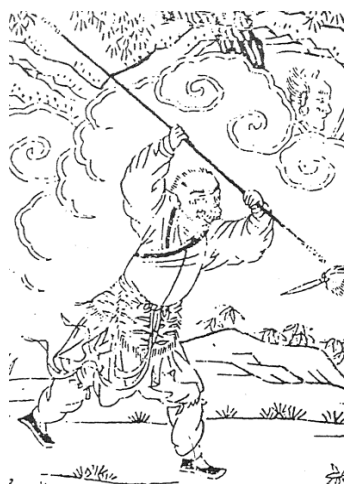
Fig. 16. Sun Wukong wearing martial arts slipper in JtW 's 'Shidetang' edition.

The images in the work present more than sufficient representations of the figure of the Monkey King, but there are two major discrepancies. In chapter 14, Sun Wukong is tricked into putting the magical circlet on, however, in most representations it does not appear on his head (it always appears in the Japanese edition, figure 4). Another difference is related to his footwear: in some representations he wears boots, in others he wears traditional martial arts slippers (see fig. 16).