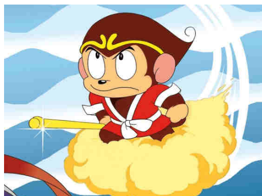
Fig. 9. Gokū on his cloud from the anime Gokū no daibōken .

Another of Sun Wukong's earliest Japanese representations is the anime series Gokū no daibōken ('The great adventure of Gokū', 1967, figure 9).