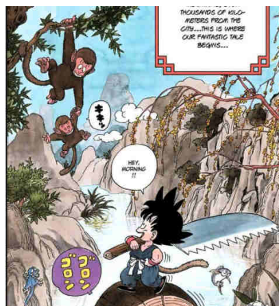
Fig. 19. Son Gokū's first appearance, from the manga Dragon Ball chapter 1.

As for his facial features, Son Gokū has big eyes, eyebrows, ears, and mouth. His hair is voluminous and pointed, diverging in different directions, and there are a few strands on his forehead. In chapter 1 of DB , he looks like a child with a sunny disposition, wearing a bluish suit, a belt, wristbands, and martial arts slippers. An eye-catching feature is the presence of a long tail.