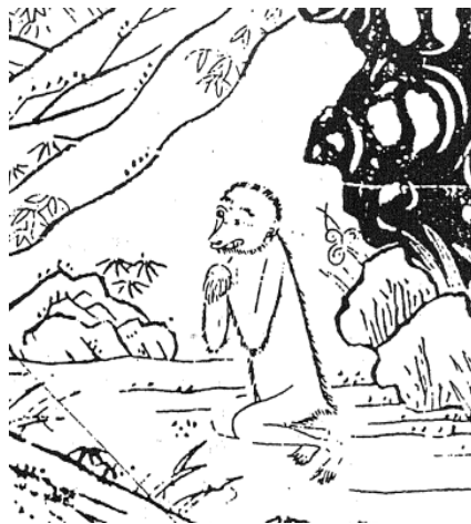
Fig. 15. Sun Wukong’s first appearance in JtW ’s ‘Shidetang’ edition.

Almost each chapter in the ‘Shidetang’ edition contains two-page illustrations that summarize what happens in the concerned chapter, for a total of 197 images. In his first appearance, Monkey King is represented as a normal monkey with a very small tail; his body seems slender and lacking in muscles (fig. 15).