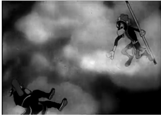
Fig. 5. The Monkey King fights Bull Demon King. Screenshots from 'Princess Iron Fan' (Modern Chinese Cultural Studies, 2020: timecode 1:03:08).

chapters 59-60-61. The focus is on the battle between Monkey King and Princess Iron Fan, whose fan is needed to extinguish the flames of the mountains.