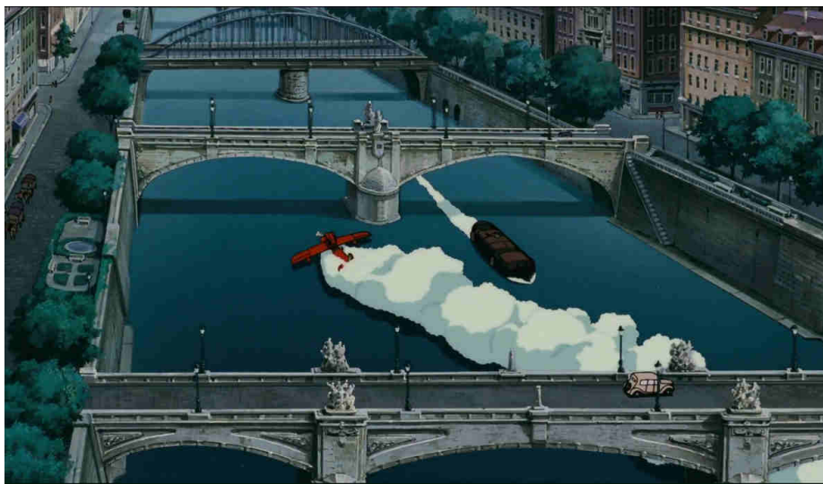
Fig. 4. Still from Porco Rosso . © Kurenai no buta , Miyazaki Hayao, 1992.