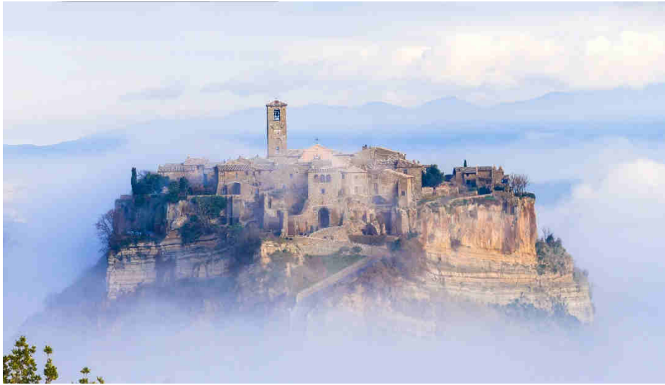
Fig. 1. Civita di Bagnoregio, Italy.