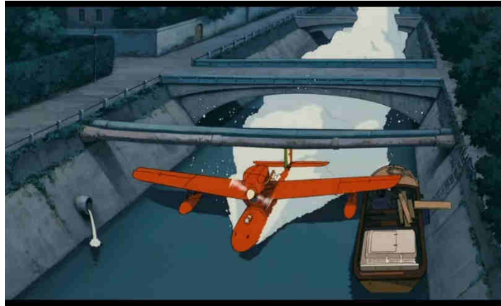
Fig. 3. Still from Porco Rosso . © Kurenai no buta , Miyazaki Hayao, 1992.