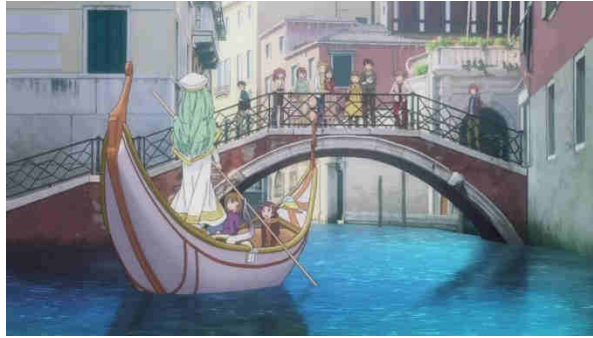
Fig. 6. Still from Aria the Crepuscolo . © Satō Jun'ichi, 2021.