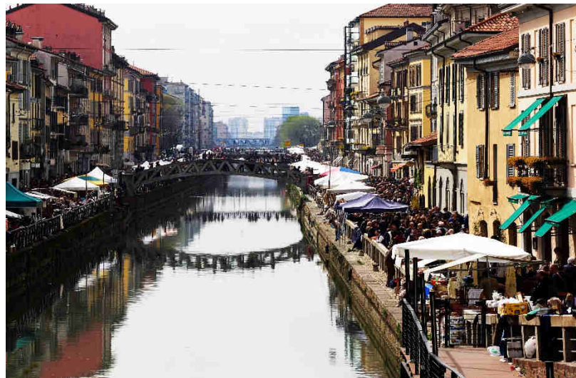
Fig. 2. Flea Market on the Naviglio Grande in Milan, Italy.