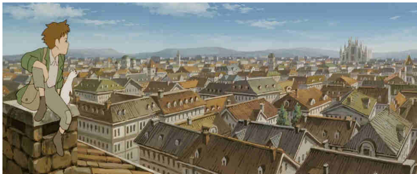
Fig. 7. Composition of stills from a panoramic shot from Romeo's Blue Skies . © Romio no aoi sora , Kusuba Kōzō, 1995.