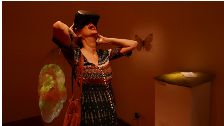
Figure 2. Butterfly}Pieris{Effect (2022) at NTU Singapore.

Another project that deals with ecological issues of us humans with our planet is Butterfly}Pieris{Effect (2022) (Figure 2). It highlights the life cycle of the Cabbage White Butterfly ( Pieris brassicae ) while advocating for biodiversity and that every species, even a pest species is a vital part of the planet's ecosystem. The project challenges the human-centric worldview, encouraging empathy and recognition of the interconnectedness of ecosystems. The art-sci installation tries to question the dichotomy of 'our' (human) gaze and 'their' (insect) point of view.