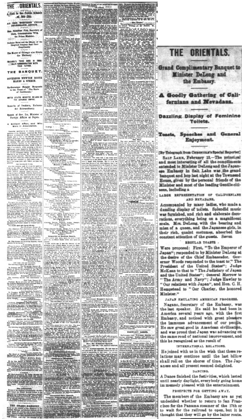
Figures 2 & 3. On the left (Fig.2), the San Francisco Chronicle , 24th January 1872; on the right (Fig. 3), excerpt of the San Francisco Chronicle , 14th February 1872.