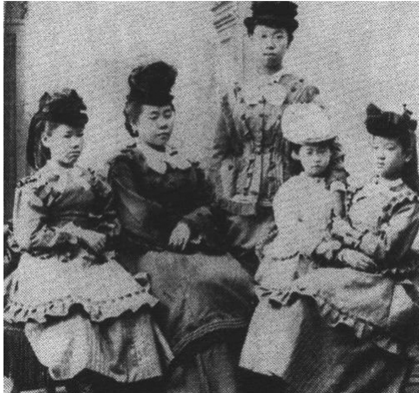
Figure 1. The five girls in Chicago, America, 1872

and the other one taken in Chicago in Western-style clothes (see figure 4). Whether those photographs circulated among the American audience remains unknown at this stage of the research. However, two of the articles mention that ‘nearly every member of the Embassy’ ( San Francisco Chronicle , 28th January) had their picture taken at the Bradley and Rulofson’s Gallery in San Francisco ( San Francisco Chronicle , 25th January). The reader is not told specifically if the girls also had their photograph taken there.