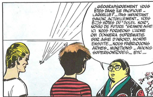
Fig.3. Jijé (1993) Tout Jijé 1956-1957 . Dupuis, 80.