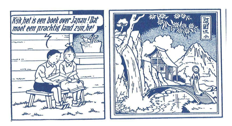
Fig.4. Vandersteen (1997) De avonturen van Suske en Wiske, 34, De Stemmenrover. Antwerpen: Standaard Uitgeverij, 2.