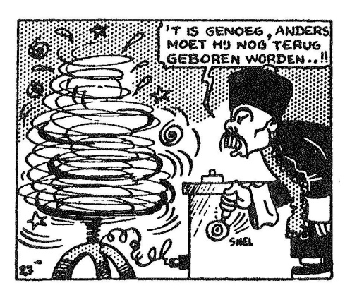
Fig.2. Sleen (1998) Nero, De Klassieke avonturen van Nero, 1, Het geheim van Matsuoka . Standaard Uitgeverij, no page number.