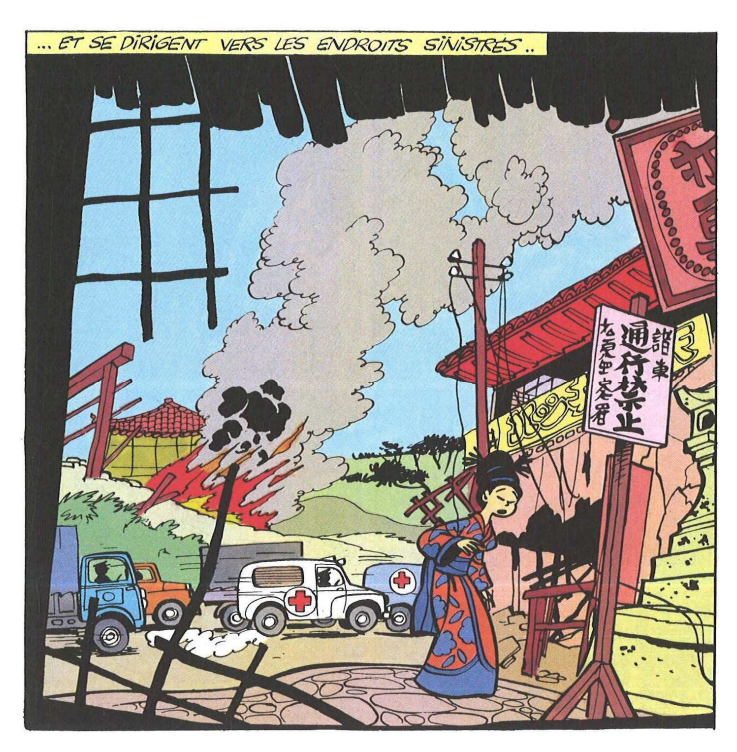
Fig.6. Will & Rosy (2009) Tif et Tondu, Intégrale 6, Horizons lointains. Dupuis, 47.