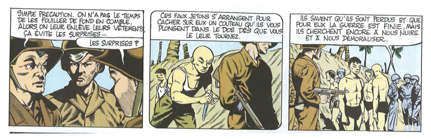
Fig.1. Hubinon & Charlier (2011) Buck Danny L'intégrale 2. Dupuis, 61.